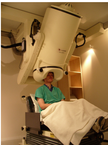
Figure 1.2. A Participant in the Scanner.

When a participant is scanned, the gantry can be moved so as to position the MEG scanner over the participant. The chair on which the participant sits is then raised up so that the participants head rests inside the helmet of the scanner (see Figure 1.2 and Figure 1.3)