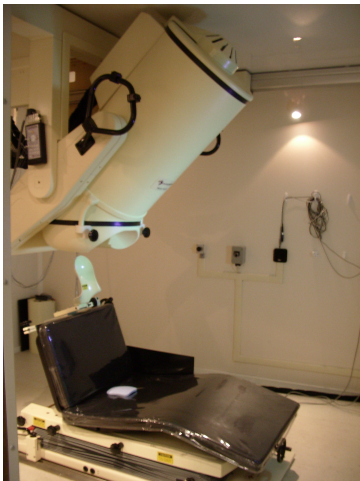
Figure 1.1. The MEG Scanner

When a participant is scanned, the gantry can be moved so as to position the MEG scanner over the participant. The chair on which the participant sits is then raised up so that the participants head rests inside the helmet of the scanner (see Figure 1.2 and Figure 1.3)